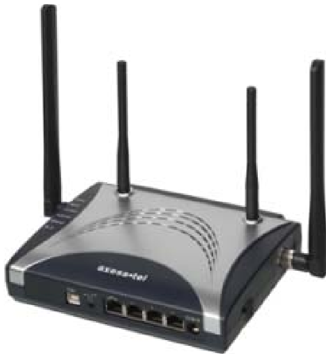
CDMA EV-DO Rev. A Wi-Fi Gateway MV440 (800/1900MHz)